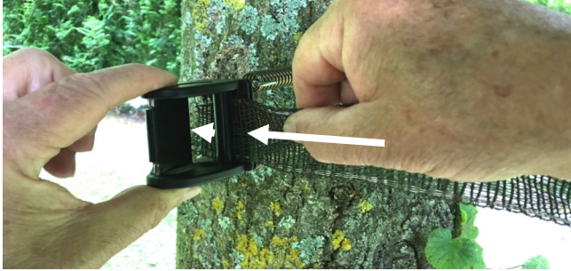
Insert the tape through the slot of the plastic buckle