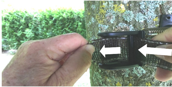
Now insert the tape back through the bigger slot