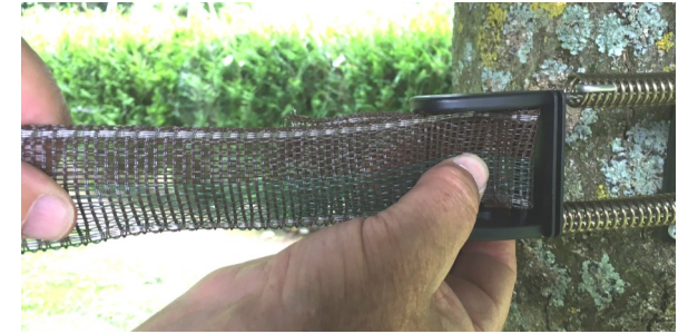
Press the two sections of tape together at the bottom of the buckle. The end of the tape is in the back.