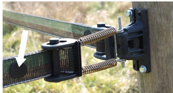
Use one round clip so the tape doesn't slip.