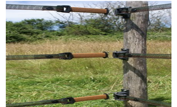
For easy manipulations 3 strands of tape is a maximum